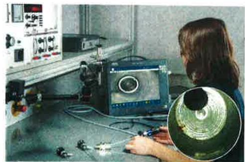
Inspecting tool components with a borescope and the TECHNO PACK® T LED documentation unit