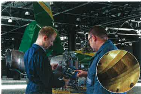
Inspecting a helicopter turbine with the MoVeo videoscope

The KARL STORZ Industrial Group has developed into a very successful full-range supplier in non-destructive visual inspection. This provides KARL STORZ with a wealth of experience across all applications. Whatever your requirement, we have the solution.