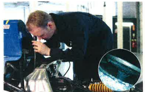
Inspecting engine components with a borescope