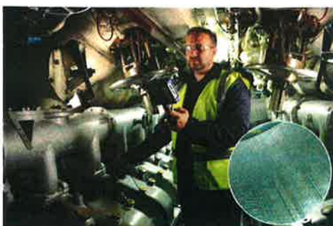
Inspecting a submarine diesel engine with the MoVeo videoscope