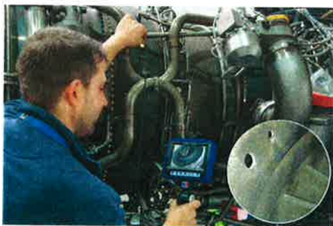
Inspecting an aircraft turbine with the MoVeo videoscope