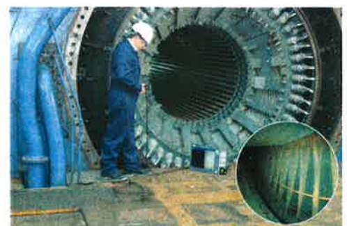
Inspecting a generator stator housing with a videoscope and the TECHNO PACK® T LED documentation unit